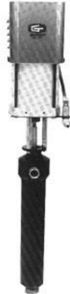
R80-31 R80-32 R80-33 R80-34 R80-35 R80-36

PUMP NO. R87-36 (STUBBY) shipped as pump only. Wetted parts carbon steel with honed, hard chrome cylinders and leather.